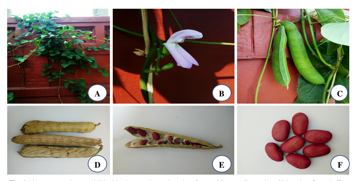
Fig. 1 ( A ) A young plant established in the experimental garden, Dept. of Botany, Ravenshaw University, Cuttack ( B ) Flower of C. gladiata ( C ) Mature green pods with ridges ( D ) Dried pods with ridges ( E ) Pods containing 8-10 seeds ( F ) Mature seeds

are particularly deficient in amino acid lysine but in contrast, it is high source of lysine (6.49%) (Ekanayake et al., 2000). The other major amino acids present are glutamic acid, aspartic acid, isoleucin, leucin, tyrosin and phenylalanine (Rajaram and Janardhanan, 1994). The lipid composition suggests that these beans could be a good source of nutrition and enhancing health benefits. Bressani et al., (1987) reported high levels of potassium (0.36g/100g) in sword bean. At the green pod and shelled vegetable stage, the seeds contain vitamin A, vitamin C, calcium and iron (Ekanayake et al., 2000). The coats of the bean C. gladiata contain good source of antioxidant phenolics having potential benefits against oxidative stress (Gan et al., 2016). The seeds of C. gladiata are known for several valuable phytochemicals such as anticancer agent, trigonelline, cytotoxic amino acids canavanine, antiviral lectin and concavalin A (Swaffer et al., 1995; Jayavardhanan et al., 1996; Suresh et al., 2015).